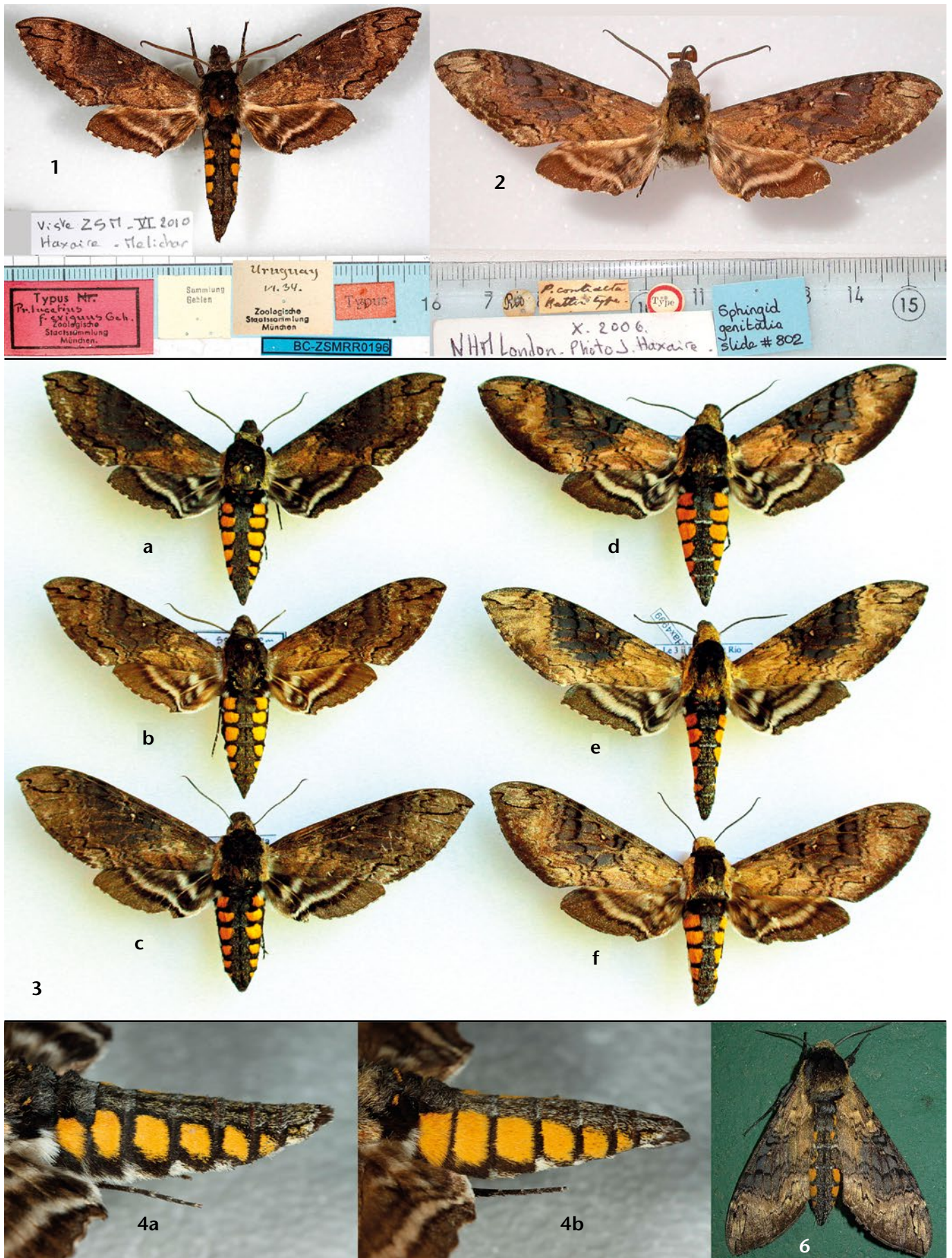
Figs. 1–2: Types, approx. natural size, dorsal views. Fig. 1: Lectotype of Protoparce lucetius exiguus (ZSM). Fig. 2: Holotype of Protoparce contracta (NHMUK). — Figs. 3a–f: Adults: 3a: Manduca exiguus ♂, Brazil, Santa Catarina; 3b: Manduca exiguus ♂, Brazil, São Paulo; 3c: Manduca exiguus ♀, Santa Catarina; 3d: Manduca contracta ♂, Bolivia, Chuquisaca; 3e: Manduca contracta ♂, Brazil, Santa Catarina; 3f: Manduca contracta ♀, Bolivia. — Figs. 4a–b: Lateral view of the abdomen: 4a: Manduca exiguus ; 4b: Manduca contracta . — Fig. 6: Manduca exiguus , resting attitude, Argentina, El Bagual, Formosa, 18. iv. 2013, Ezequiel Osvaldo NUÑEZ BUSTOS.